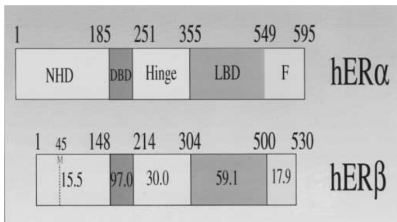
Figure 2 Comparison of the primary structures of ER \alpha and ER \beta , respectively. The figures above the receptor representations indicate the number of amino acids, with number 1 being the most N-terminal. The numbers within the ER \beta receptor represent the degree of homology (%) between respective domains in the two receptors.

the protective effect of estrogens on vascular lesions involving inhibition of smooth muscle cell proliferation. These results are in good agreement with previous experiments on ER \alpha -/- mice showing that the vascular protective effect of estrogens in experimental vascular