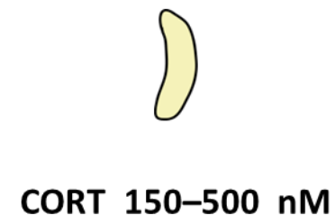
Fig. S1A Freshly isolated hippocampus