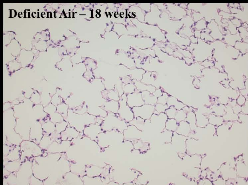
Deficient Air – 18 weeks