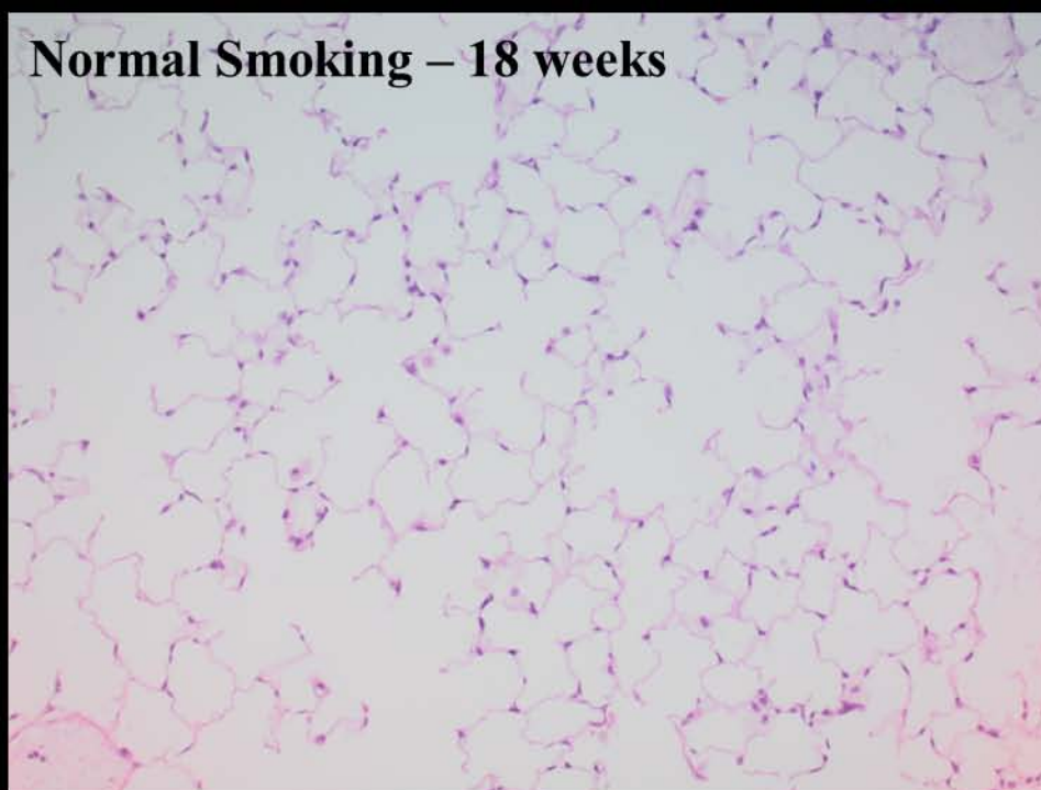
Normal Smoking – 18 weeks